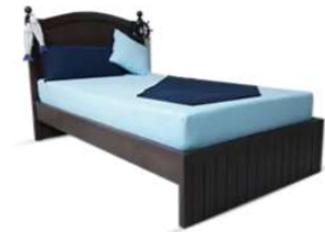
Kids Fitted Sheets