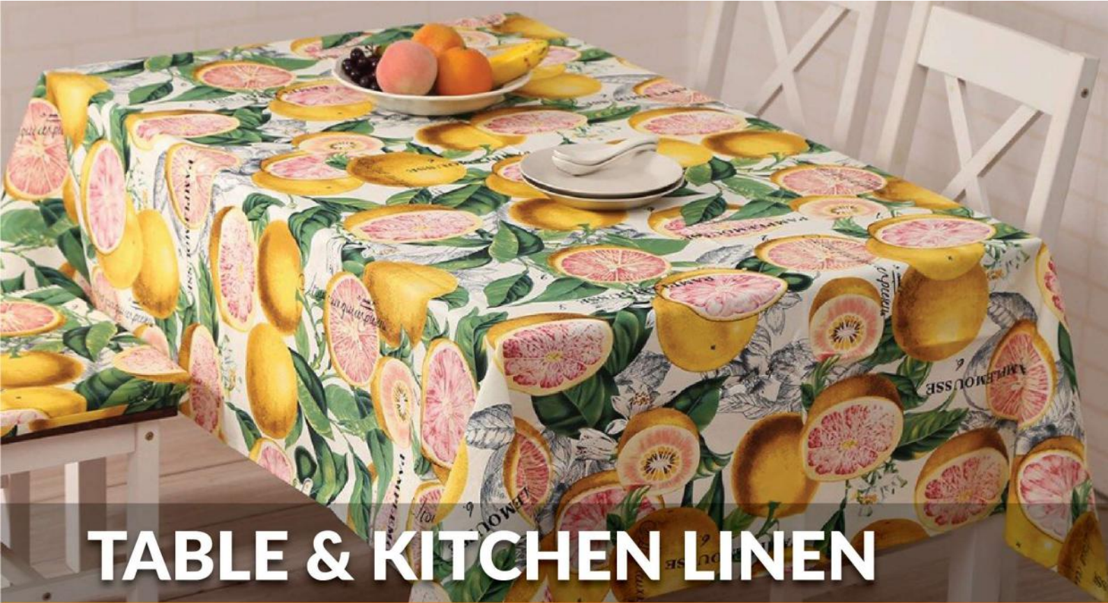
TABLE & KITCHEN LINEN

We are specialized in producing Uni-Dyed / Printed Table & Kitchen Linen in different composition i.e. 100% Cotton Poly-Cotton and Polyester-Denier Cotton, Duck / Half Panama Weave, Twill Weave and Plain Weave. Loneta, Reinforce, Cretonne, Percale & Sateen. Table Cloths, Round Table Cloths, Napkins, Table Runners, Aprons, Kitchen Towels, Pot Holders & Oven Mittens etc.