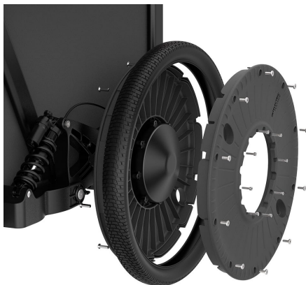
Simple tyre change thanks to Plug & Play.

What sets the INTELECTRA apart is not only its high payload capacity and robust construction, but also the versatile integration of the specially developed iSHS drive system (INTELECTRIC Serial Hybrid System). This serial hybrid drive with regenerative braking and plug-and-play architecture is designed for minimal maintenance and user-friendly handling, making it ideal for demanding, high-usage environments.