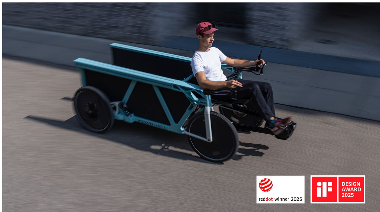
DDG INTELECTRA cargo bike design awards

The first deliveries will begin in October 2025.