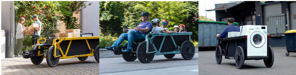
Versatile applications of the INTELECTRA cargo bike

commercial vehicle. Developed and manufactured in Germany, this heavy-duty cargo bike is designed for logistics companies, municipalities, facility services, fleet operators, trade and commerce, landscaping, shuttle and passenger transport, and urban businesses seeking sustainable mobility with real-world practicality.