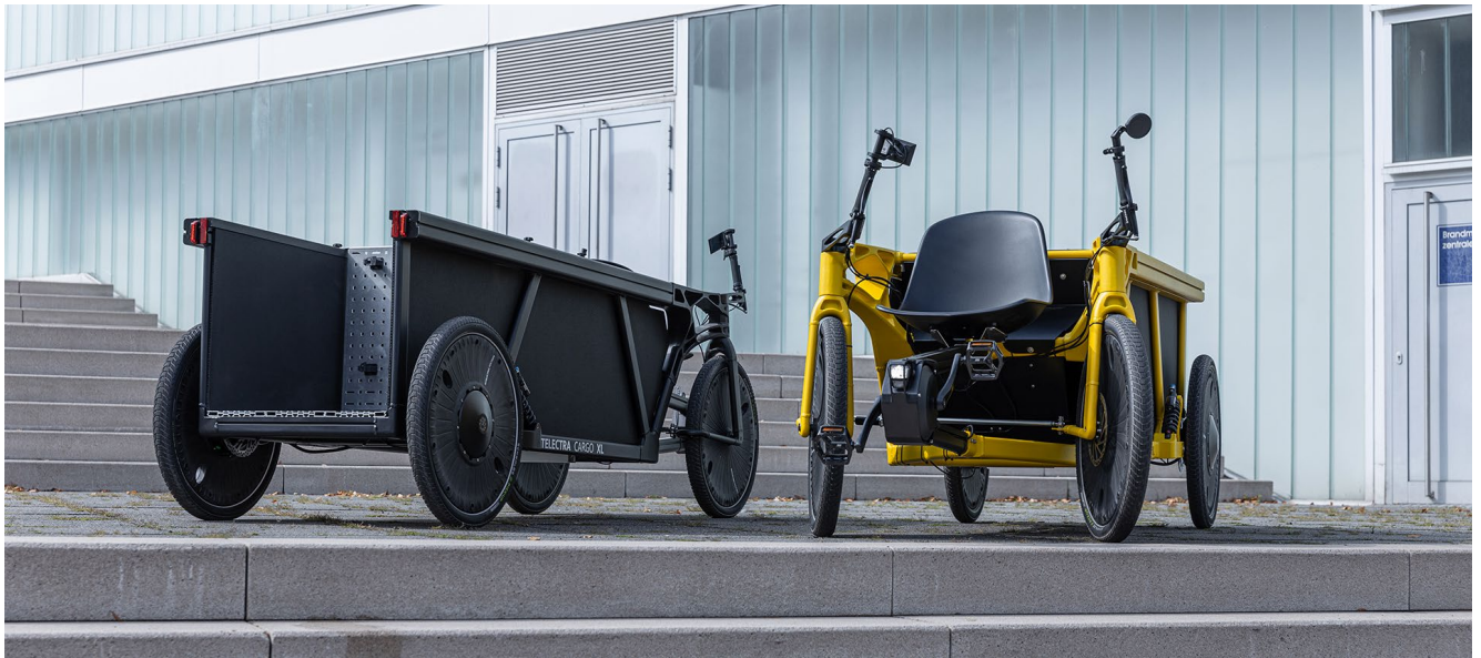
DDG INTELECTRA heavy duty bike

At EUROBIKE 2025 in Frankfurt, the production-ready version of the INTELECTRA Cargobike will be presented for the first time – as part of a limited first edition, which is already available for pre-order.