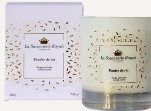
Poudre de riz