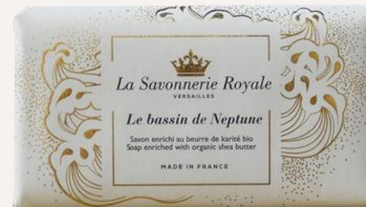
Le bassin de Neptune