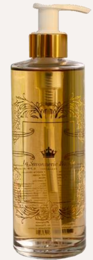
Une Nuit au Château