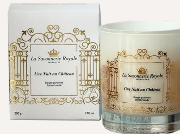
Une Nuit au Château