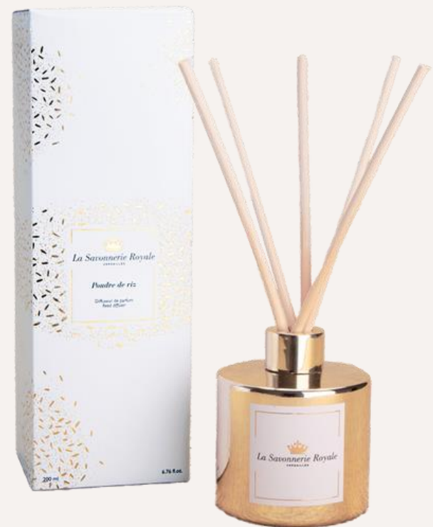
Poudre de riz