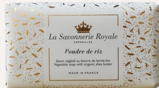
Poudre de riz