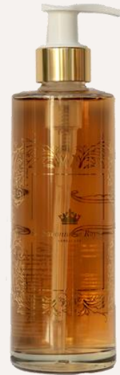
Le bassin de Neptune