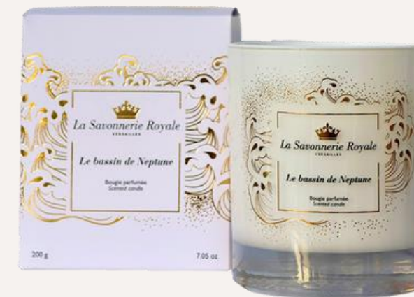
Le bassin de Neptune