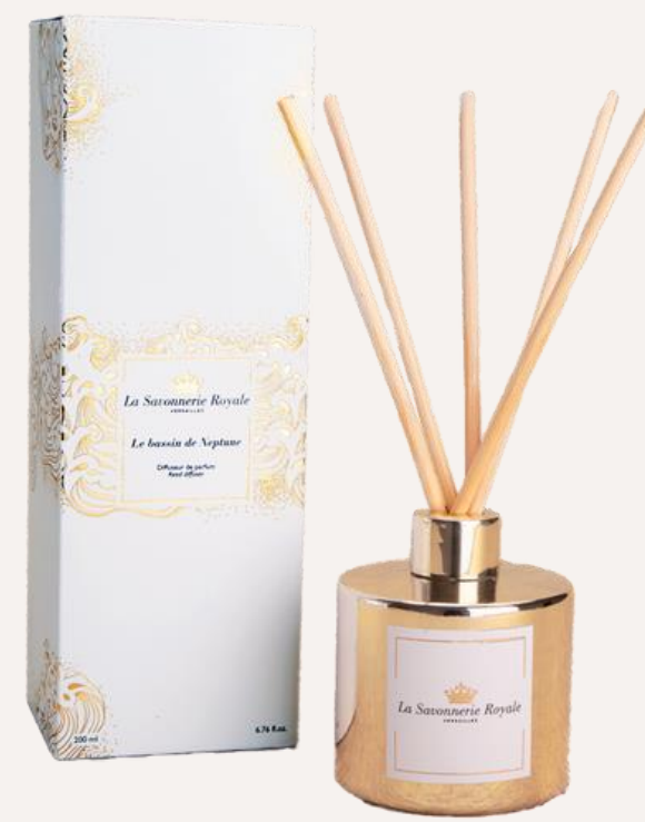
Le bassin de Neptune