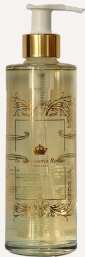
Poudre de riz