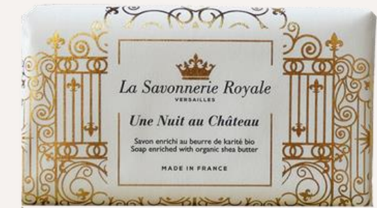
Une Nuit au Château