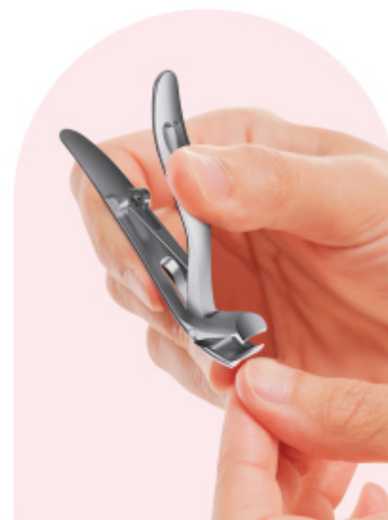
Manicure & Pedicure