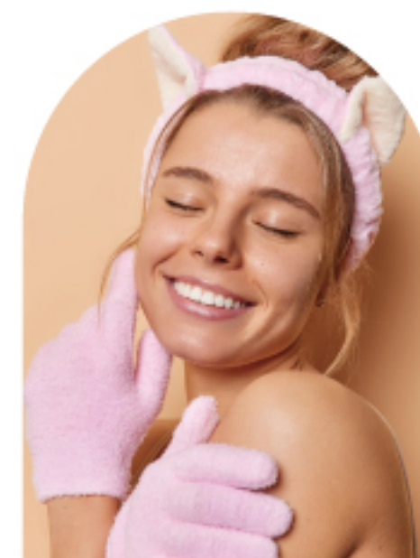
Bath & Hair