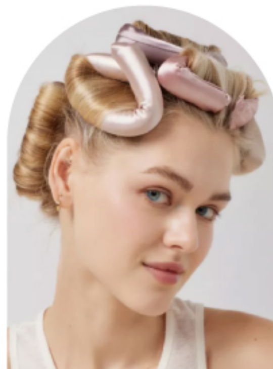
Bundle Heatless Curling