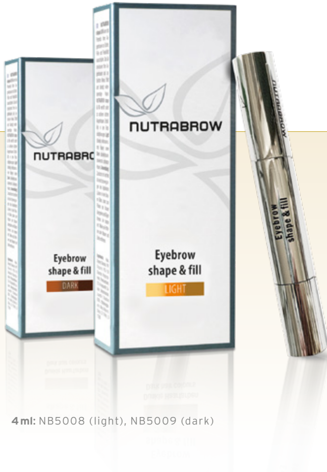
4 ml: NB5008 (light), NB5009 (dark)

Contour and colour for perfect eyebrow styles: NUTRABROW Eyebrow shape & fill - available for light and dark colours.