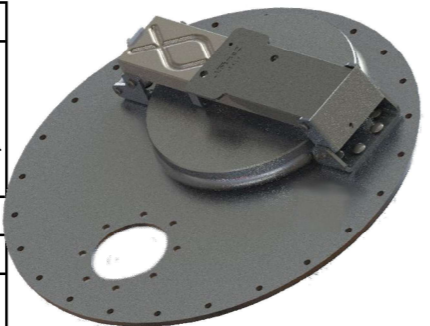
117200.115 (1) 500mm aluminum bolted cover with mounting hole for breather vent, vapour recovery valve