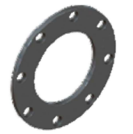
785051 (3) Aluminium TTMA Flange 4"