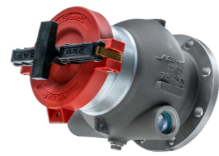
784070 (1) Dn100 vapour recovery API valve