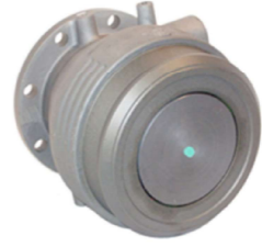
786020 (1) 4" Automatic API gaskets included