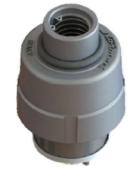
416350 (2) Breather vent