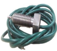
105365 (1) Ground bolt