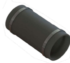
543030 (2) Rubber hose