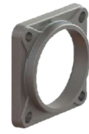
300689 (2) 4" aluminium square flange