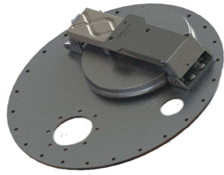
115090 (2) Aluminium Neck-ring DN500