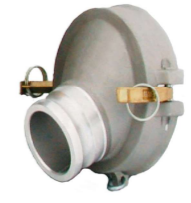
784245 (1) 4" API unloading connector