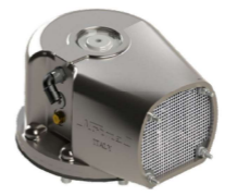
543065.1 (1) Dump valve normally open