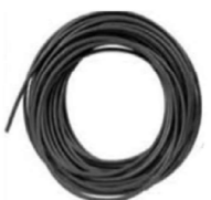
105316.8 (1) 5 wires cable, length 8 meters