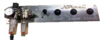
10.52.49 (1) Control panel WITH FRL group, push-pull and pneumatic light