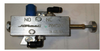
784520 (1) Pneumatic actuator valve for API couplers