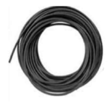
082033 (25) 6mm black nylon pipe L=1mt.