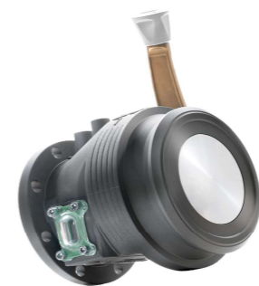
786120.1 (1) 4" Mechanical API gaskets included