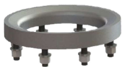
30.06.05.15 (2) 4" aluminium sump