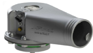
543000 (2) 3" Vapour recovery valve