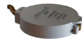
785035.5 (2) API dust cap