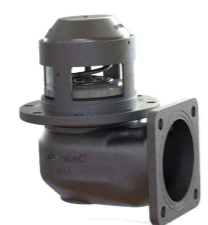
904170.1 (2) Sequential pneumatic foot valve 4"-gasket not included