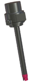
105362 (1) Optical sensor 5 wire L 12"