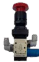
105212 (2) EMERGENCY BUTTON