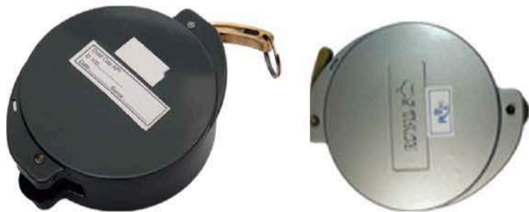
Dust Cap API Adaptor