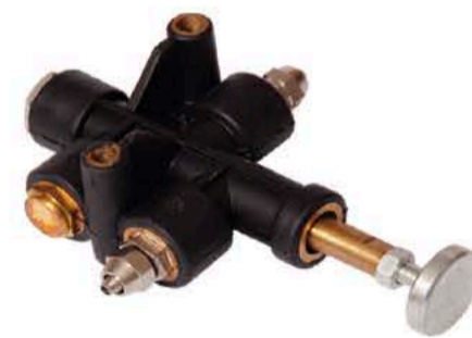
Brake Interlock on API