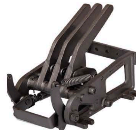
Sump Flange 3" (75mm) 4" (100mm)