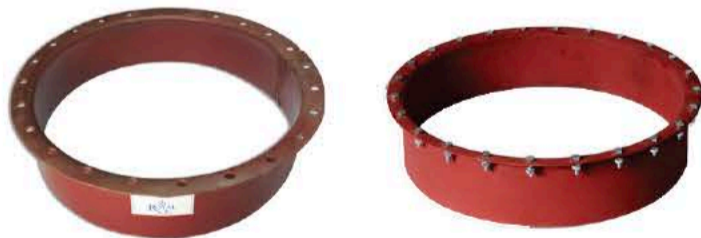
Weld Ring Manhole 16" & 20"