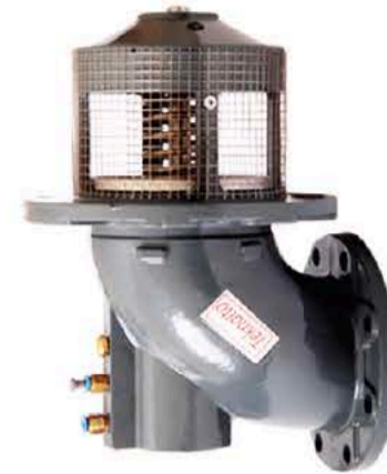
Bottom Valve Pneumatic 4" (100mm)