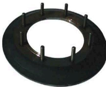
Mechanical Operator 1, 2, 3, 4 Lever