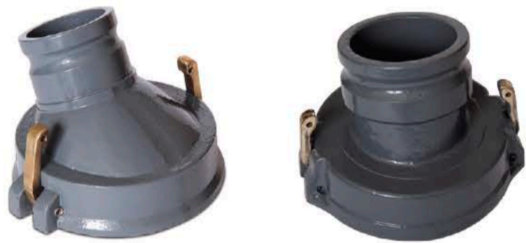
Gravity Discharge Coupler 3" & 4"