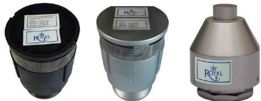
Pressure & Vacuum Vent