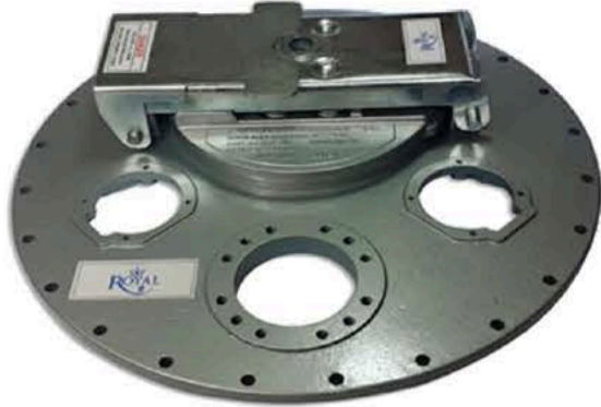
Manhole Cover 20" (500mm)