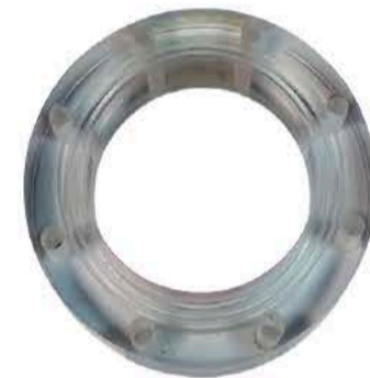
Sight Glass API Adaptor