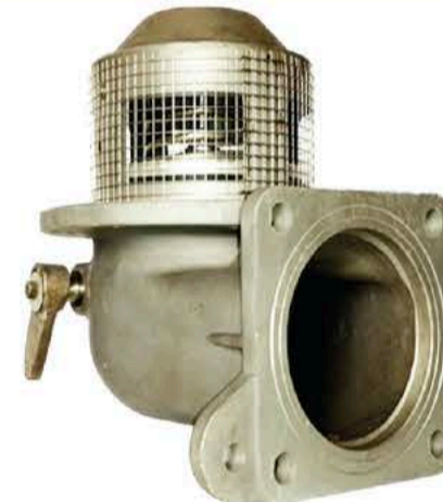
Bottom Valve Mechanical 3" (75mm)