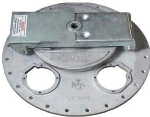
Manhole Cover 16" (460mm)