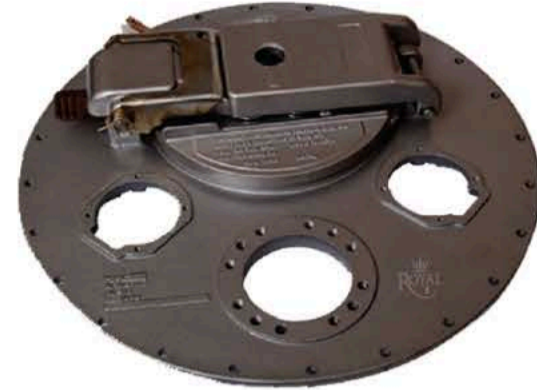
Manhole Cover 20" (500mm)