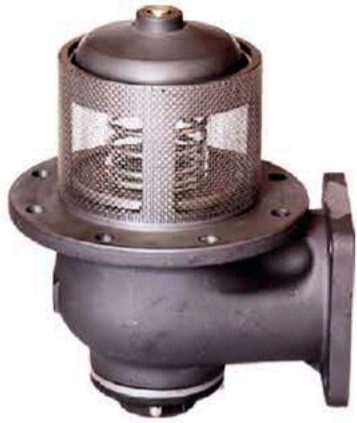
Bottom Valve Pneumatic 4" (100mm)