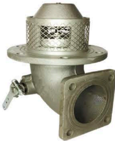
Bottom Valve Mechanical 4" (100mm)