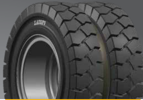
DUAL ASSEMBLY STD