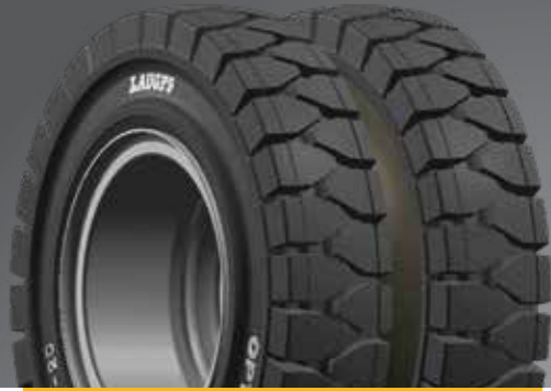
DUAL ASSEMBLY OPTIMA