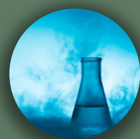
Conventional batteries store Energy Electro Chemically