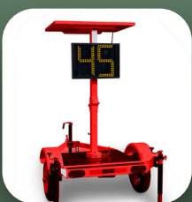
Mobile Solar Traffic Sign