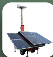
Mobile Solar Radar Station