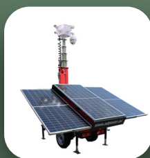
Mobile Solar surveillance