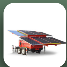
Mobile Solar Generator System