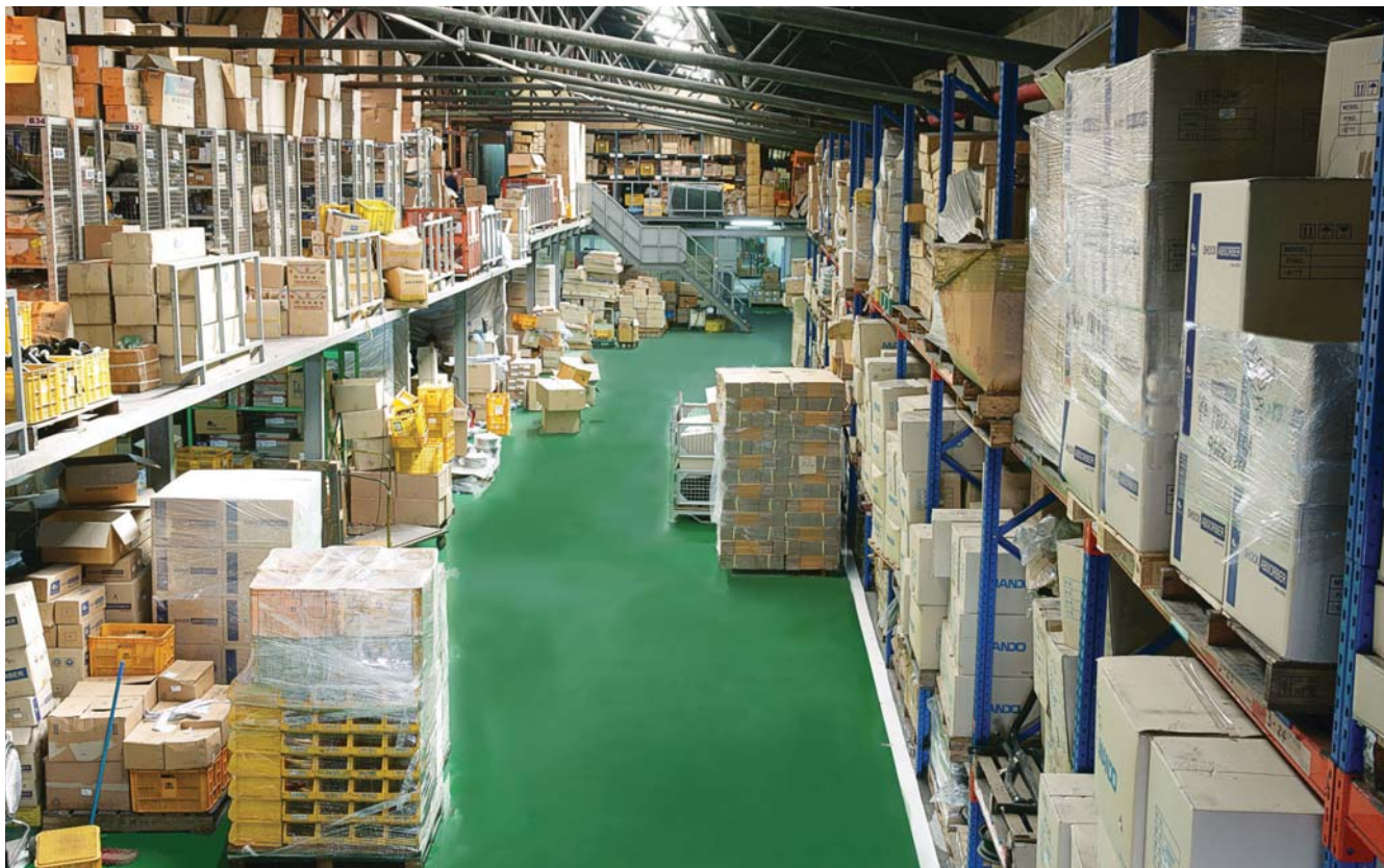
Warehouse : KOREA AUTOPARTS CO.,LTD.