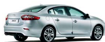
SM3 : FLUENCE