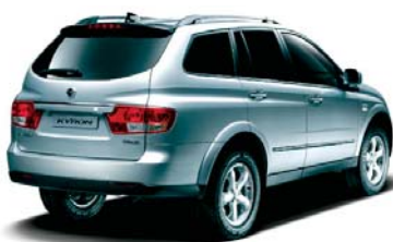
NEW KYRON : RONDO