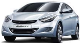
AVANTE : ELANTRA