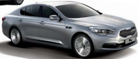
K9 : QUORIS