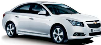
LACETTI PREMIERE : CHEVROLET CRUISE