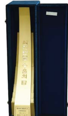
U$30,000,000 EXPORT TOWER 2012 KOREAN GOVERNMENT