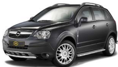
WINSTORM : CAPTIVA WINSTORM MAXX : OPEL ANTARA