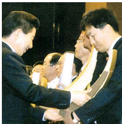
US$10,000,000 EXPORT TOWER 2003 ROH, MOO-HYUN / THE PRESIDENT