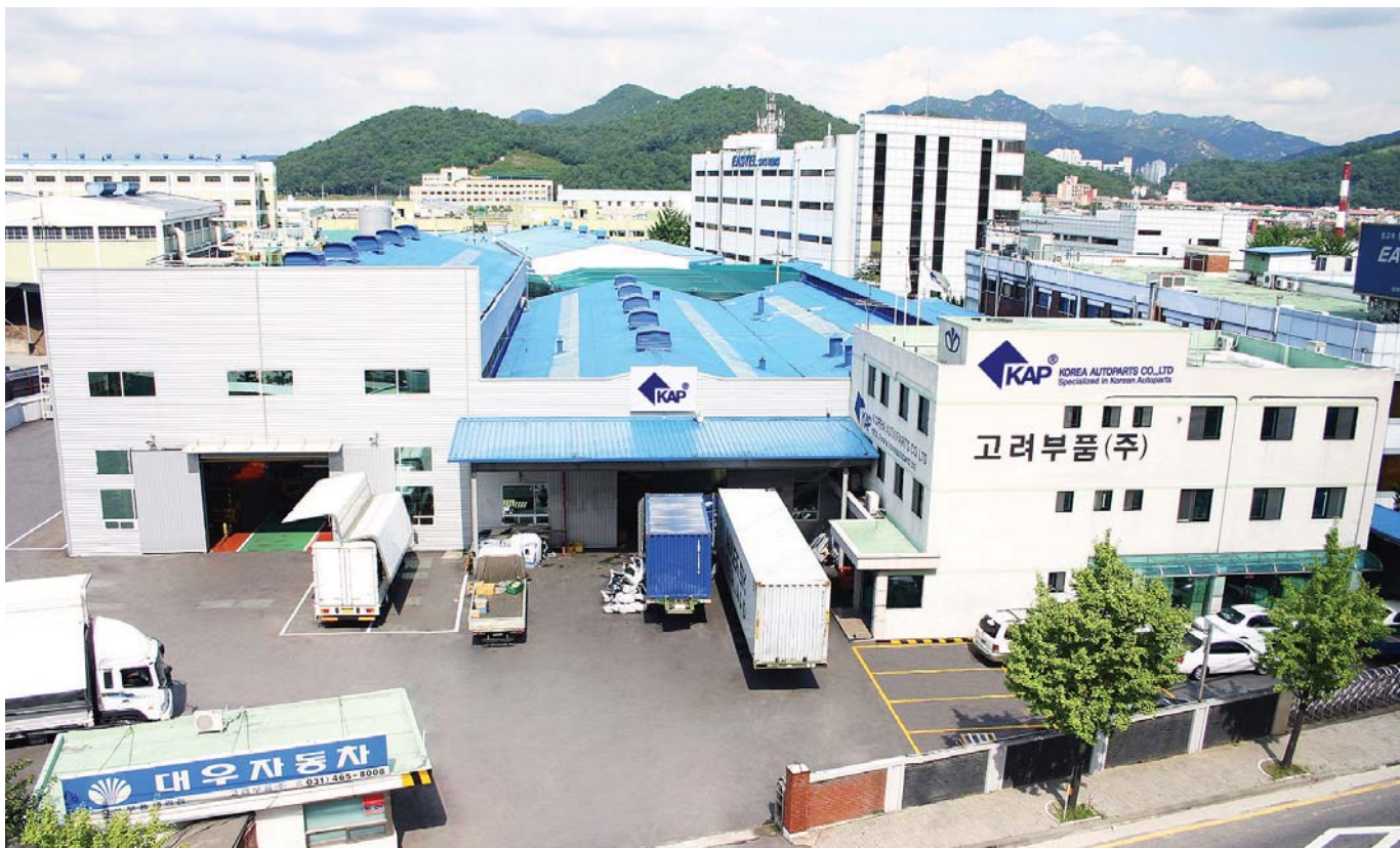
Front view : KOREA AUTOPARTS CO.,LTD.