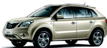
QM5 : KOLEOS