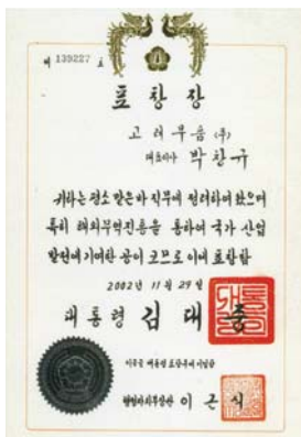
PRESIDENTIAL AWARD 2002 KIM, DAE-JUNG / THE PRESIDENT

KOREA AUTOPARTS CO.,LTD. were awarded the "GOVERNMENT PRESIDENTIAL AWARDS" by Korean president.