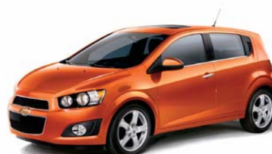
GENTRA X : CHEVROLET AVEO