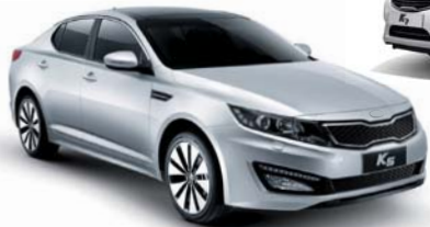
K5 : OPTIMA