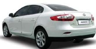
SM3 : NISSAN SUNNY