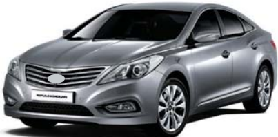
GRANDEUR : AZERA