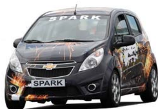
MATIZ CREATIVE : CHEVROLET SPARK