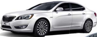
K7 : CADENZA