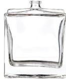
60 ML VANESSA JUST CASUAL