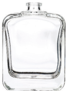
50 ML PERFUME