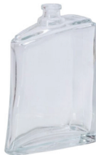
100 ML ZC DK