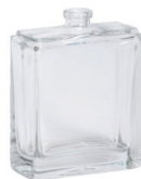
60 ML VANESA JUST CASUAL