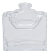
50 ML VSAR