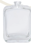
50 ML AG PERFUME