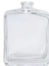
100 ML HC DH