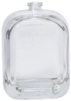
100 ML HC MEDALLION