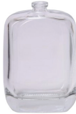
100 ML USTRA