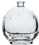
100 ML AG HC FH