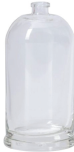
100 ML ZC XC