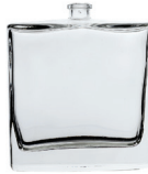
100 ML JE