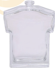
100 ML HC TSHIRT