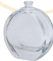
100 ML HC TSHIRT