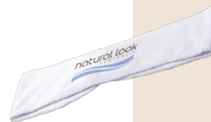
TERRY TOWELLING HEAD BAND