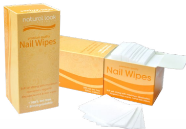
NAIL WIPES BOX 325PCS, BAG 900PCS