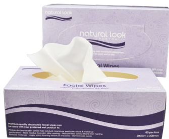
DISPOSABLE FACIAL WIPES 80PCS

Formulated with natural ingredients & FREE from acetone or harsh chemicals. Gently cleans the hardest of make-up, bacteria and build up from natural and synthetic bristle cosmetic and hair brushes, while maintaining condition for optimum brush performance between clients. 125mL, 1L