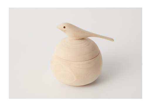
DOVE TREASURE BOX

This special collection is a reminder of the need for peace in the world today, especially amidst the refugee crisis.