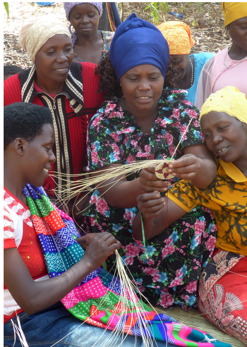
Burundian refugee artisans who have returned to Burundi after years in exile, crafting the Bright Bloom ornament.