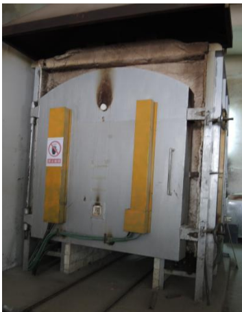
2cbm Electronic Kiln