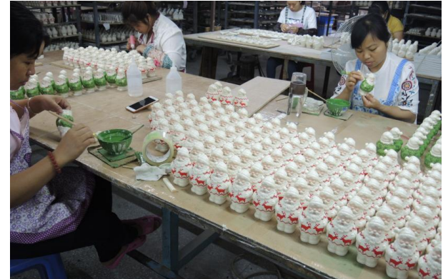
Over Glaze Painting Dept.