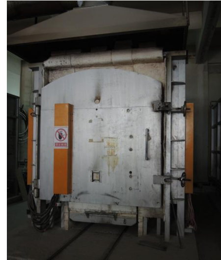
4cbm Electronic Kiln