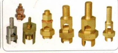
EXTRA STUD & EXTRA PRESSURE PADS, SPLIT BOLT CONNECTORS / SERVICE POST CONNECTORS