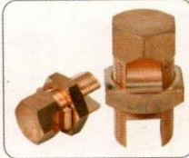
MIDDLE EAST & EUROPE STANDARD