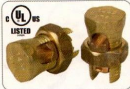
SPLIT BOLT CONNECTORS