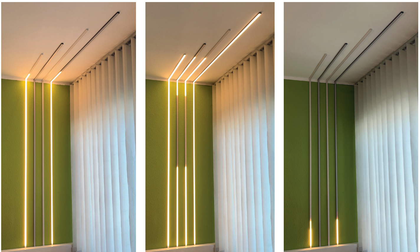
Seven real application scenarios showcase the capabilities of the LUMIS SPI controller – complete with parameter display and scene preview.