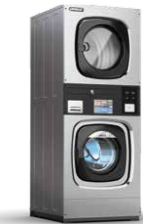
SOFTMOUNT STACKED WASHER DRYER