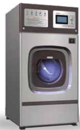
SINGLE-DRUM WASHER DRYER COMBO