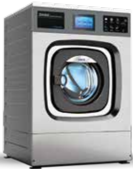
SOFTMOUNT WASHER EXTRACTOR