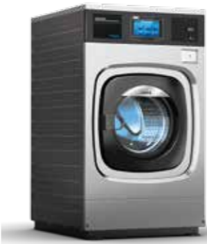
HARDMOUNT WASHER EXTRACTOR