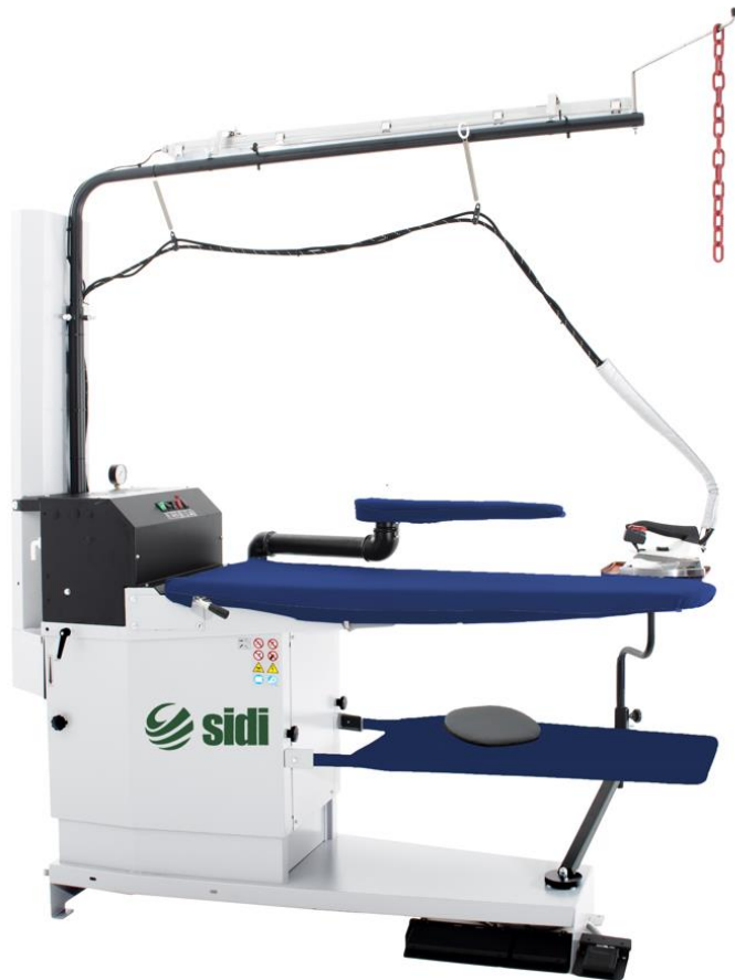
Table NOVA is available with fixed height or with adjustable height.