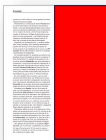
1/2 vertical page 105 x 280 mm