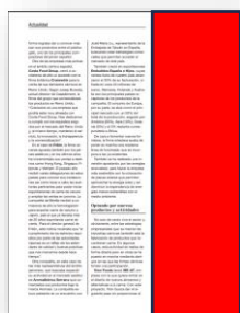
1/3 vertical page 75 x 280 mm