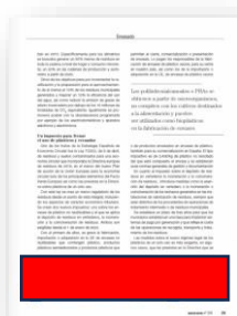
Strip 182 x 40 mm