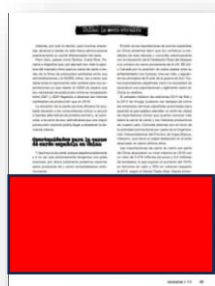
1/3 horizontal page 210 x 90 mm