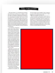
Large Island 120 x 160 mm