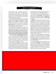
1/4 horizontal page 210 x 70 mm