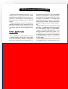
1/2 horizontal page 210 x 130 mm