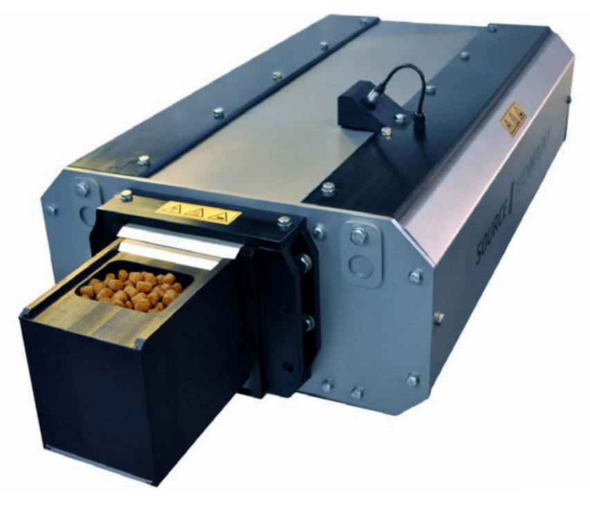
BDS <sup>™</sup> Density and moisture analysis every minute.

With a high frequency of analysis every minute, you can eliminate weight inconsistency problems. Your product weight stays under control all the way to the end of the line, eliminating over- or under-filled bags. The high-frequency data also gives you superior control over your essential processing equipment's ongoing performance, such as, for example, extruders. Detected variations can possibly mean mechanical failure.