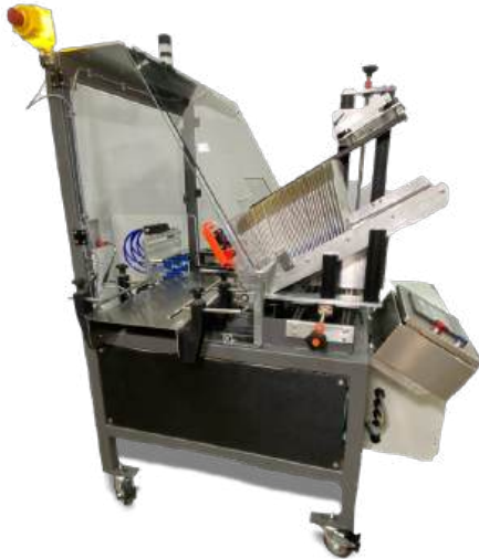
KCLF - Keymac Crash Lock Former