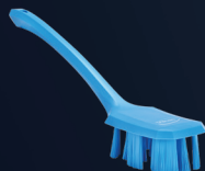
UST Long Handled Hand Brush, Stiff Art. no: 4196x