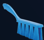
UST Bench Brush, Medium Art. no: 4585x