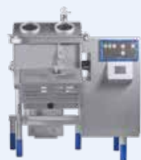
K230 Salad and delicatessen mixing machine