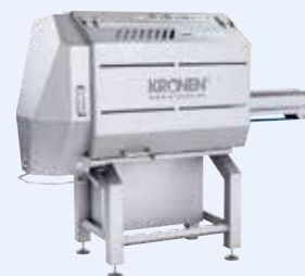
GS 10-2 Belt cutting machine