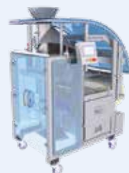
FLEX L Packaging machine