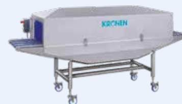
UVC-Lock Disinfection lock