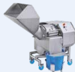
KUJ HC-220 Cube, strip & slice cutting machine