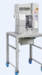
AS 6 Apple peeling and slicing machine