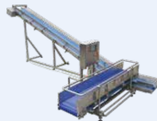
Recipe weighing belt