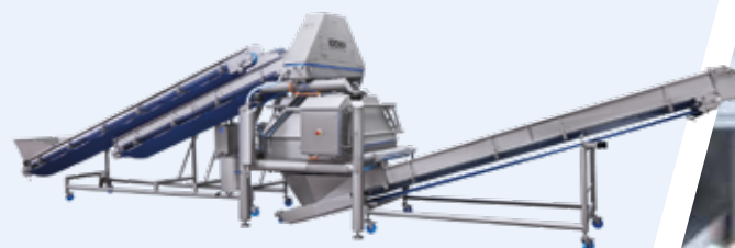
K850 Drying system