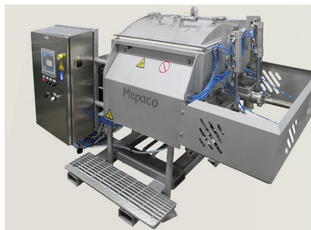
Mepaco® provides ThermaBlend® test equipment to determine the effectiveness of their application