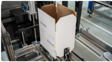
1 Box folding