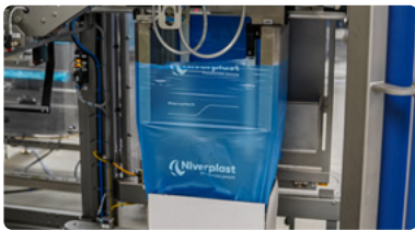
4 Bag spreading