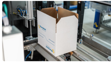
2 Bottom flap folding