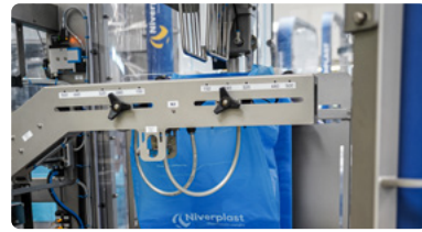
3 Bag opening