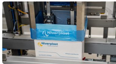
5 Bag inserting