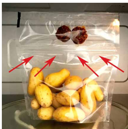
STEAM RELEASE SYSTEM

A. Spice compartment B. Product compartment