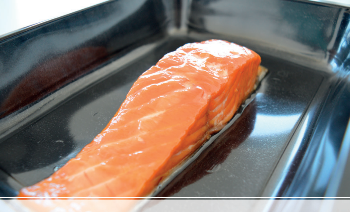
Product protrusion up to 25 mm

More efficient thanks to its dual die system