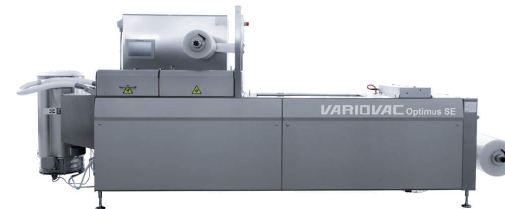
Example: Optimus SE