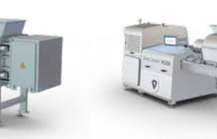
Pre-Sizer (300 + 600)