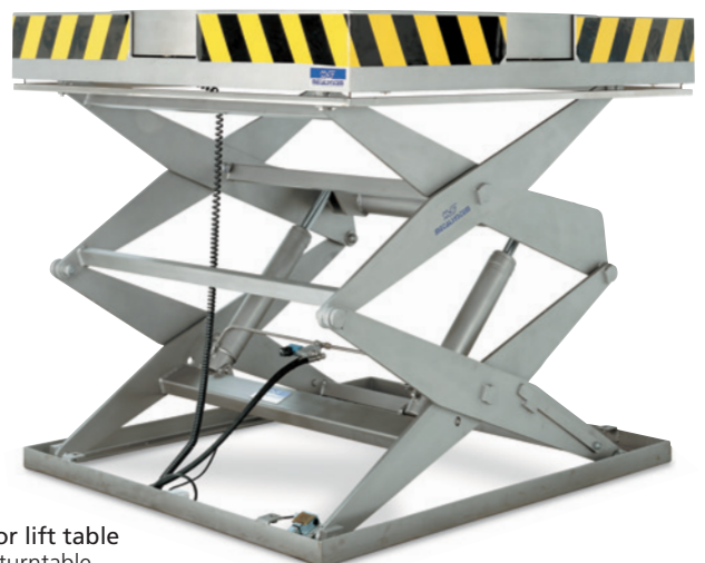
Double-scissor lift table With manual turntable.