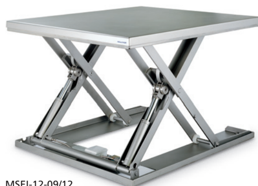
MSEI-12-09/12 Rectangular shape.