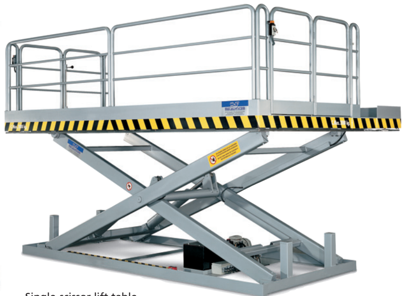
Single-scissor lift table With handrails and access gates.