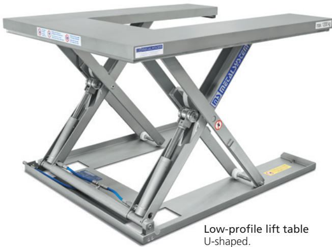
Low-profile lift table U-shaped.