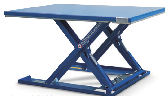
MSEAP-12-09/08 Rectangular shape.