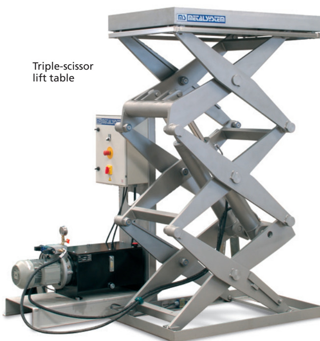
Triple-scissor lift table