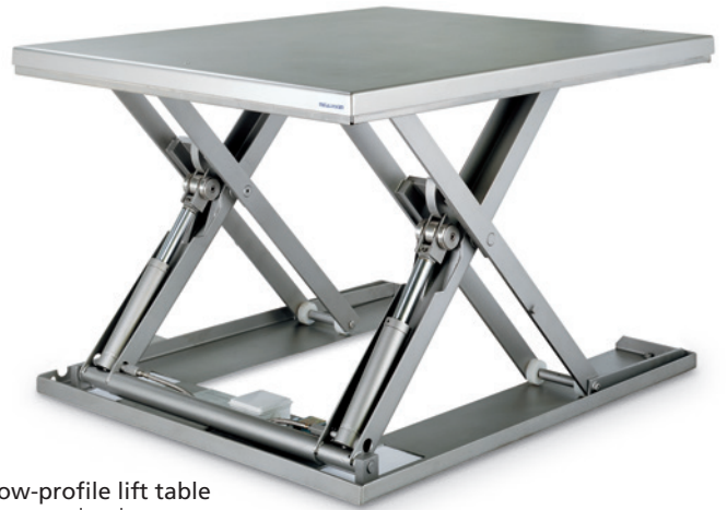
Low-profile lift table Rectangular shape.