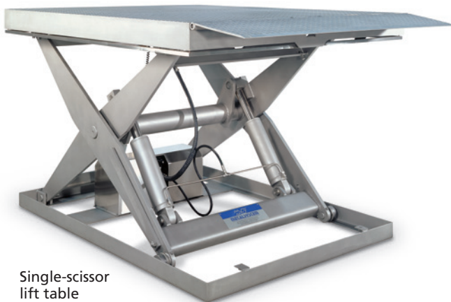
Single-scissor lift table Automatic lip.