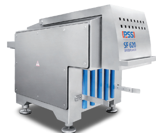
Fresh meat / Frozen meatblocks grinders High speed cutters / vacuum cutters Frozen meatblocks flakers