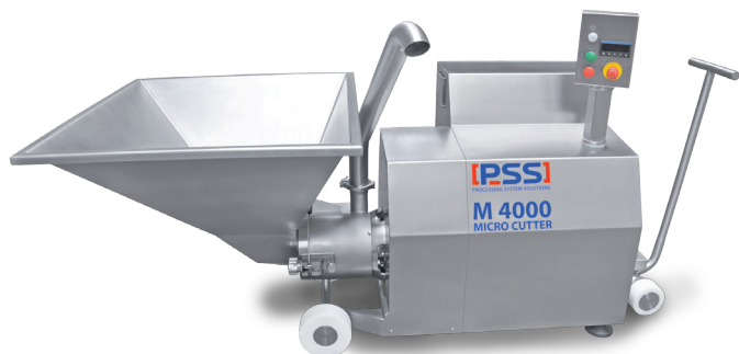
PSS M 4000 Microcutter