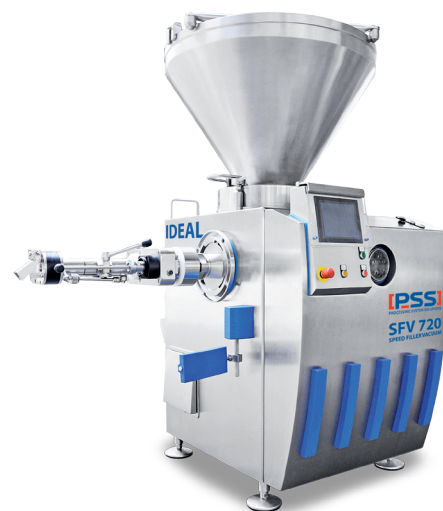
PSS SFV 720 - Speed Filler Vacuum

From experience we can say that this model is a worthy competitor to other European manufacturers of fillers. We are grateful to PSS company for successful cooperation since 2014.,”