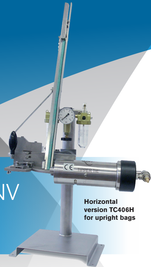
Horizontal version TC406H for upright bags

TCV table-top clippers are used wherever absolutely secure closure is needed. Sausage, poultry, game, mussels and clams as well as packaged fresh meat and cheese can be sealed with these machines.