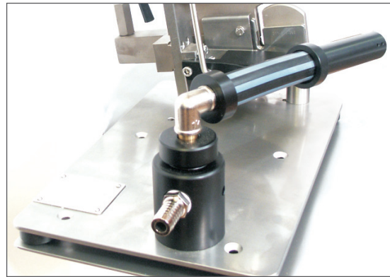
Pivotable extractor pipe for vacuum packaging