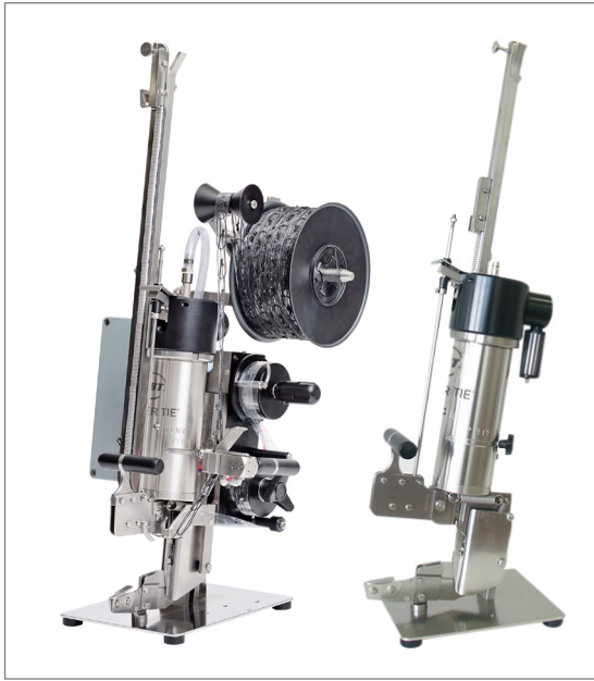
TCNV model with automatic loop feeder and TCNV model with pneumatic cutting knife