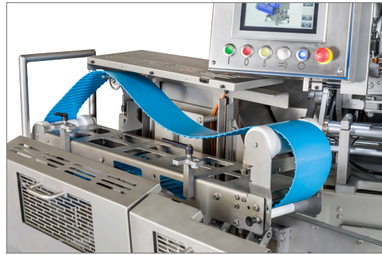
Easy clean tensionless pivoting conveyor makes the critical job of sanitation much easier

JBT TIPPER TIE SVU6800 - Designed to work.