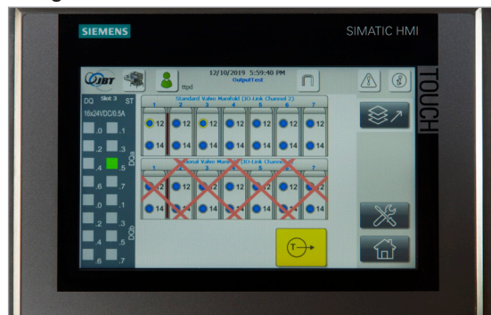
Touch screen controls are easy to understand and operate and include a diagnostic tool for easy service