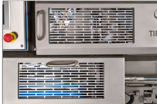
Optional Stainless steel window inserts can be ordered in place of the haze resistant Poly Carbonate