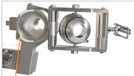
Easy Clean rotor (60mm shown)