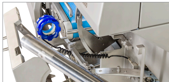
S-curve Skin brake assistant for quicker casing changes