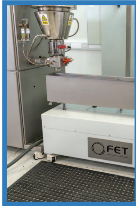
4.2 Spinneret holder optimises extrusion into coagulation tank. Air gap or submerged spinneret available. Unique Venturi thread up device