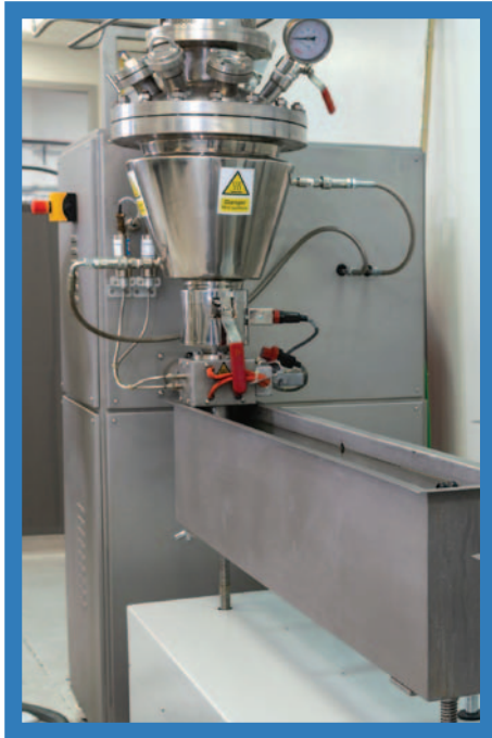
4.1 Multiple dope vessel sizes available with high viscosity versions, corrosion resistant, temperature control and homogenised stirring capacity