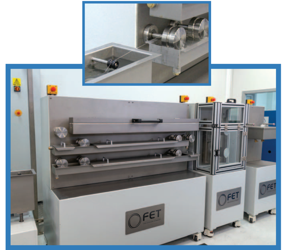
4.3 Washing haul-off system for maximum efficiency combined with filament drying system with hot air circulation