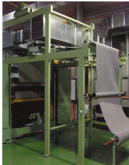
View of Fabric Processing

To reach best quality, New embossing machine has a Heating System, Special Elastic Rolls and another additional equipments. Most of all, we engrave the surface of roll by an engraving machine to get the Customer's satisfaction.