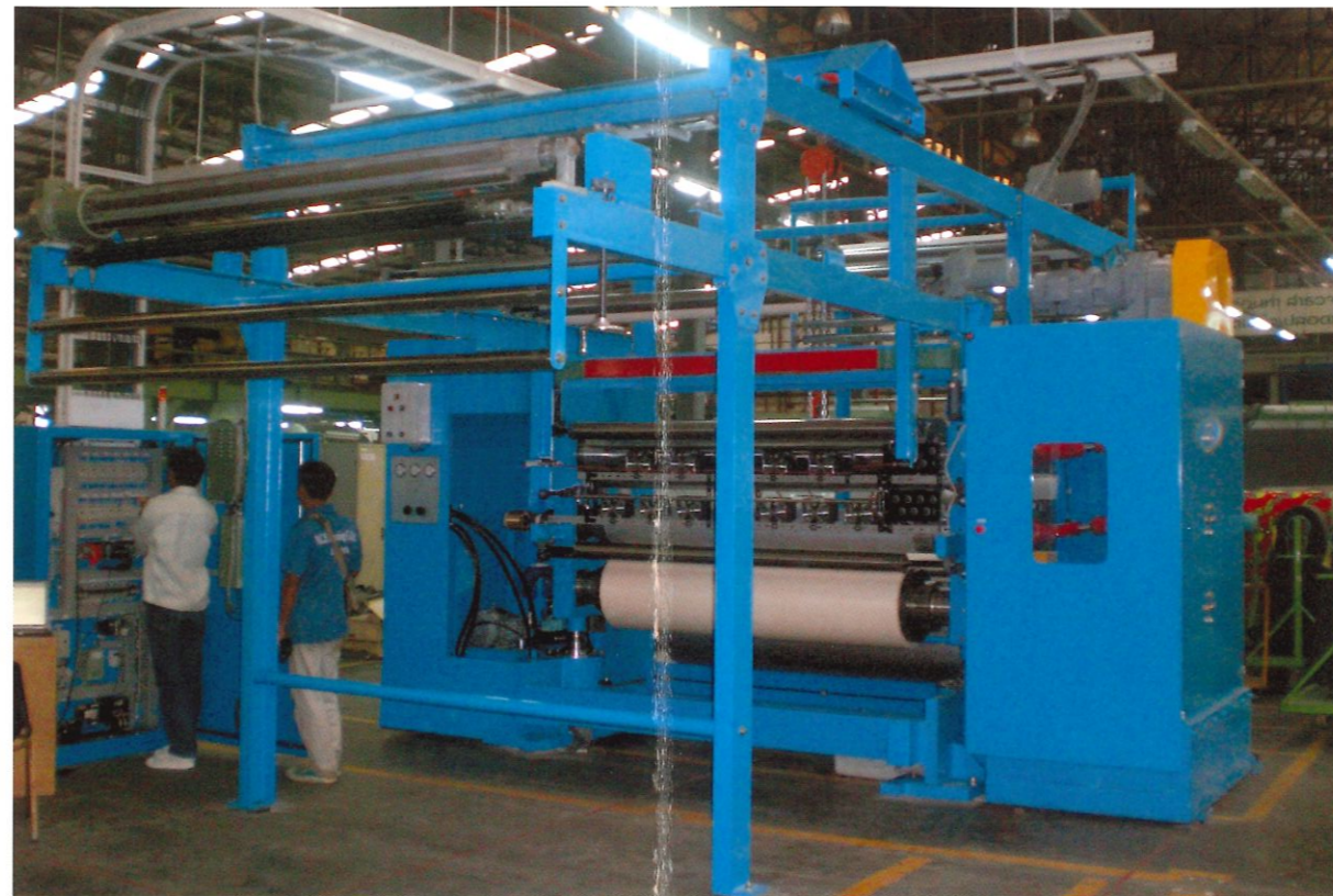
Model : DWEBC3-1800