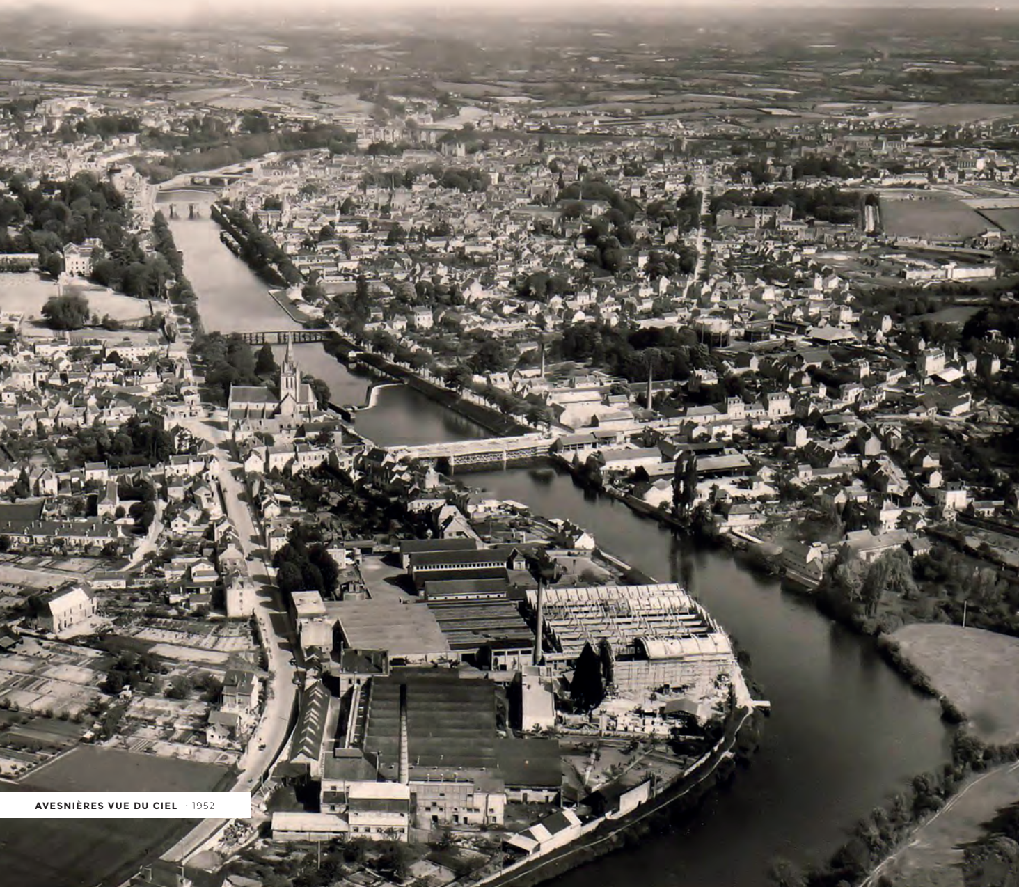
AVESNIÈRES VUE DU CIEL • 1952