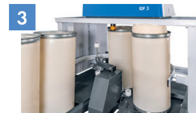
Can changer becomes a game-changer