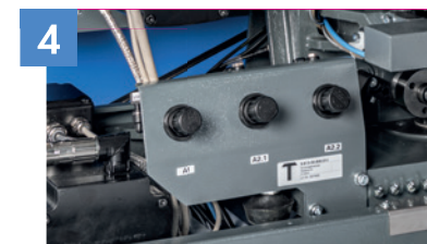
New top roller pressure monitoring