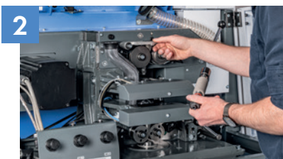
Easy access to every part