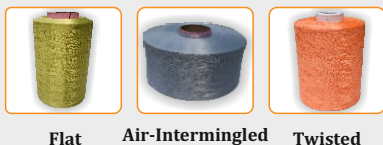
Flat Air-Intermingled Twisted