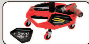
Detachable Storage Box