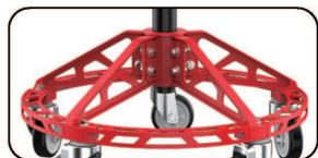
Durable Aluminum Frame