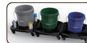
Patent Connection Multiple Dolly