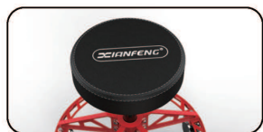
Synthetic leather,foam-padded seat