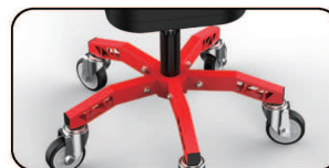
Durable Steel Frame