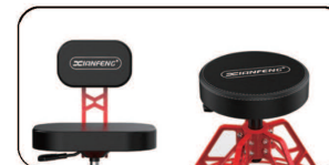
Two different seats