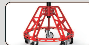
Durable Aluminum Frame