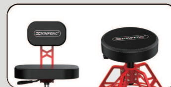
Two different seats