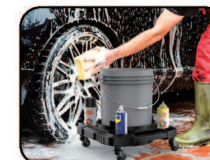
Can hold 10-12 inches or 25 to 30cm of buckets