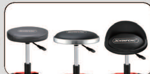
Three Different Seats