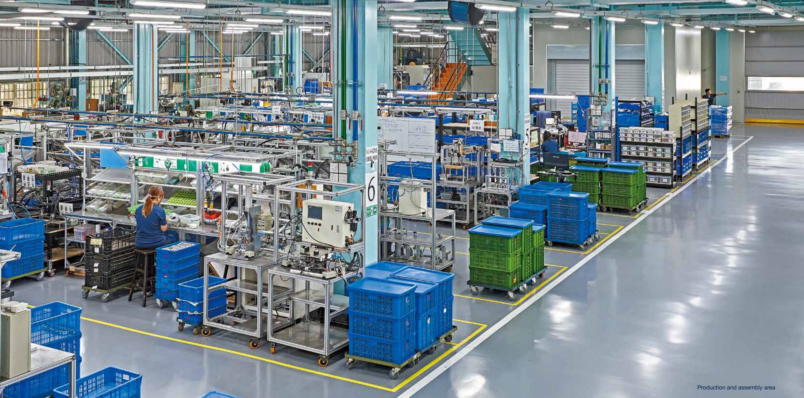
Production and assembly area