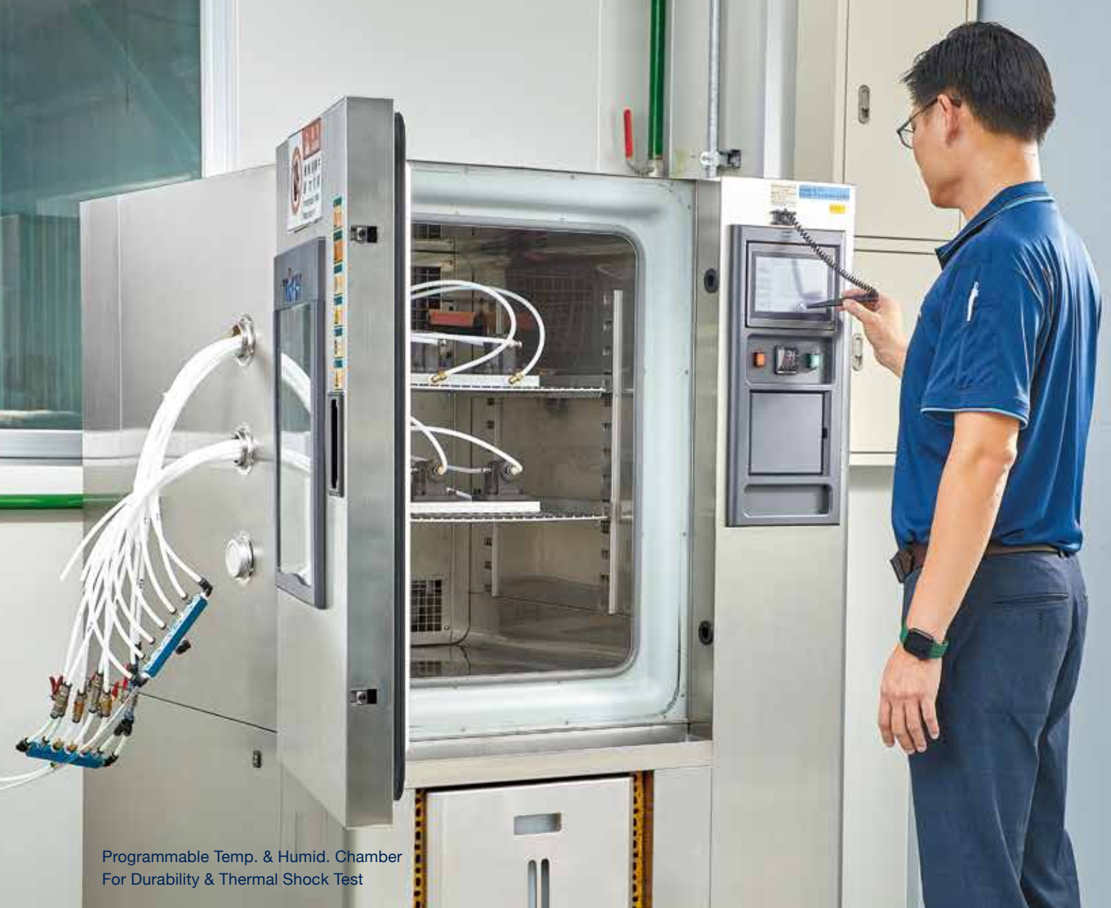
Programmable Temp. & Humid. Chamber For Durability & Thermal Shock Test