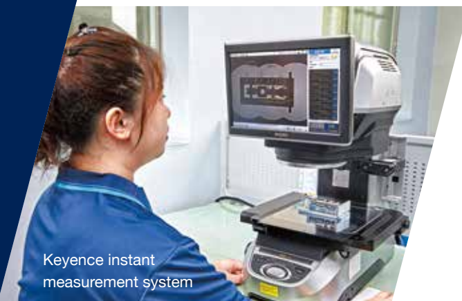
Keyence instant measurement system