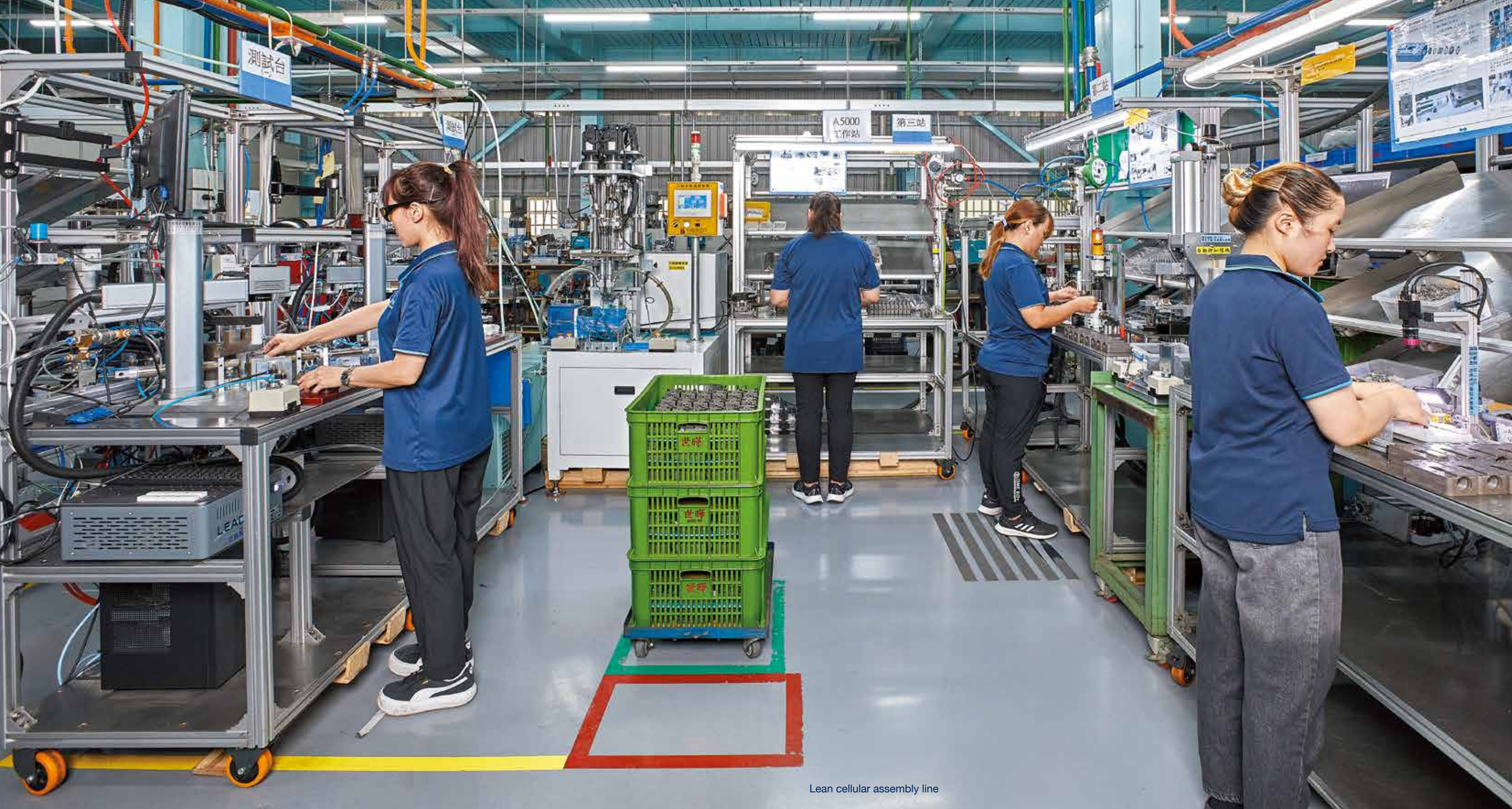
Lean cellular assembly line