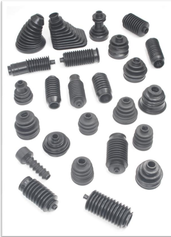
CV & DRIVE SHAFT BOOTS