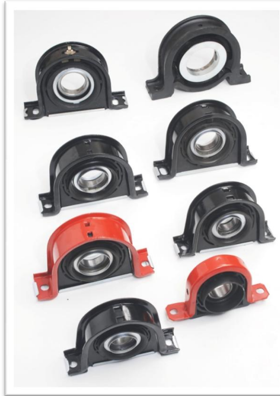
PROPELLER SHAFT MOUNTS