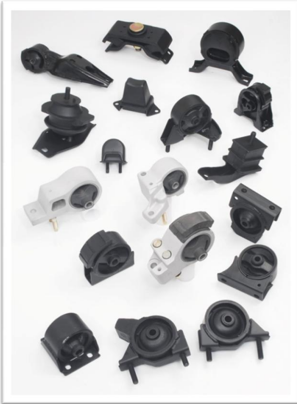
RUBBER TO METAL MOUNTS