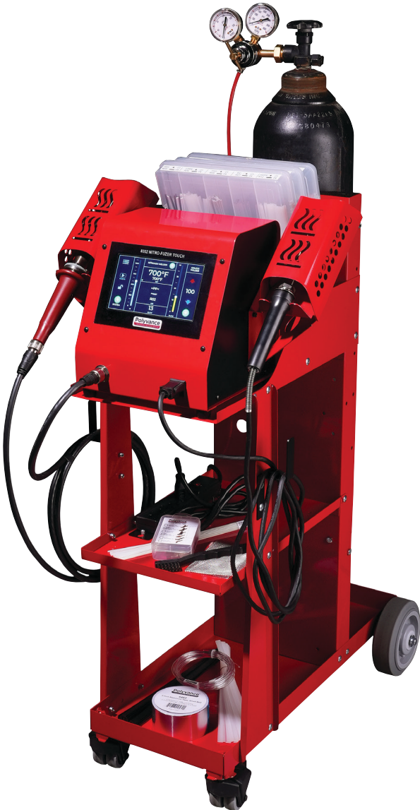
8302 Nitro-Fuzer Touch (uses bottled nitrogen)

The Nitro-Fuzer Touch is available through Polyvance’s Nitro-Fuzer Distributor network. Contact Polyvance to receive the information for the Nitro-Fuzer Distributor in your area.