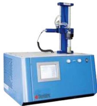
APPARATUS FOR ANALYSIS OF CLOUD AND POUR POINTS