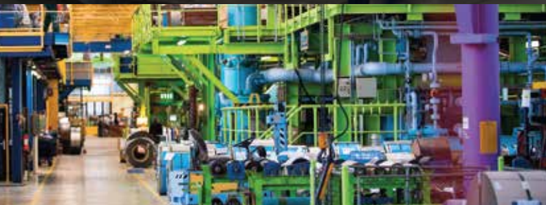
1 Million Square Feet