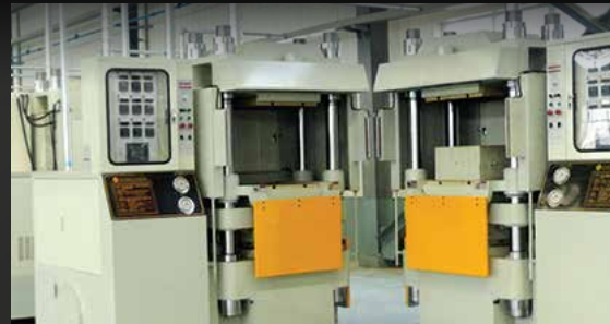
OE Assembly Line with Automated Presses