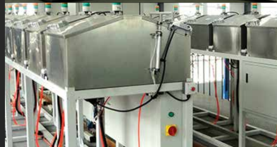
3 Dimensional Prototype Assembly Line