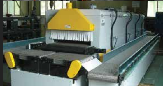
Brake Shoe Production