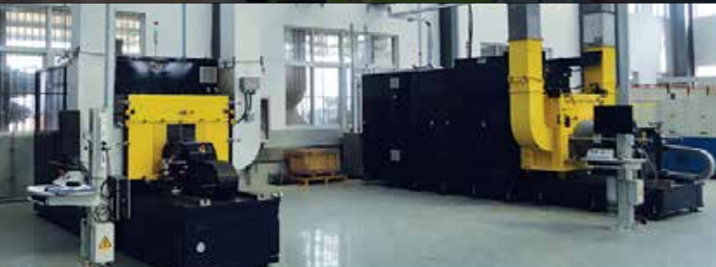
Link Dyno Testing