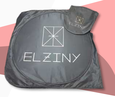
Balata Cover Washing Cover Maintenance kit