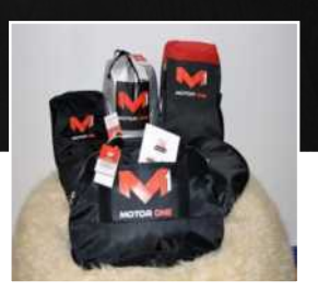
Car Cover Celia bags