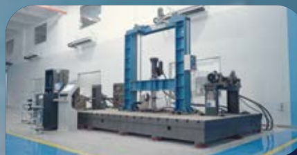
MTS four-channel test system