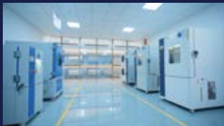
High and low temperature lab