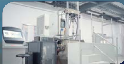
MTS 850 shock absorber test system