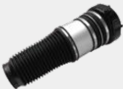
PV Air spring