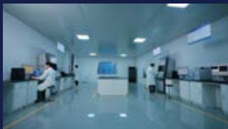
Non-metallic material properties lab

BUILD NATIONAL SUSPENSION EXPERIMENT CENTER.