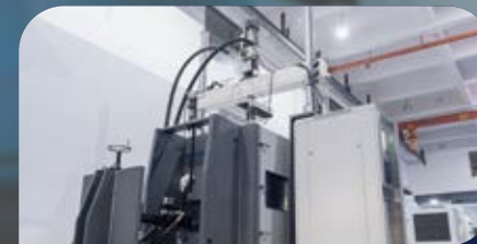
High and low temperature 1/4 suspension system