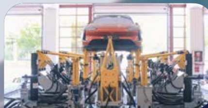
MTS329 24-channel axial coupling road simulation test system