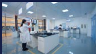
Metal Materials Analysis Lab