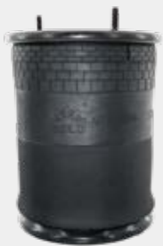
CV Air spring