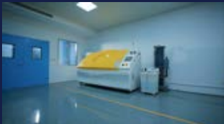
Environmental Corrosion Lab