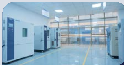
Environmental mimetic lab