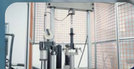
MTS 849 shock absorber test system