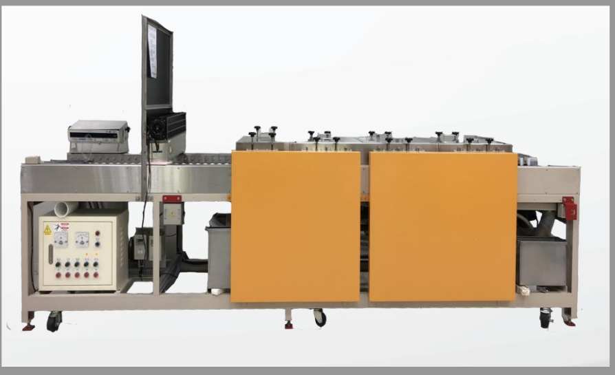
Glass Cleaning Machine